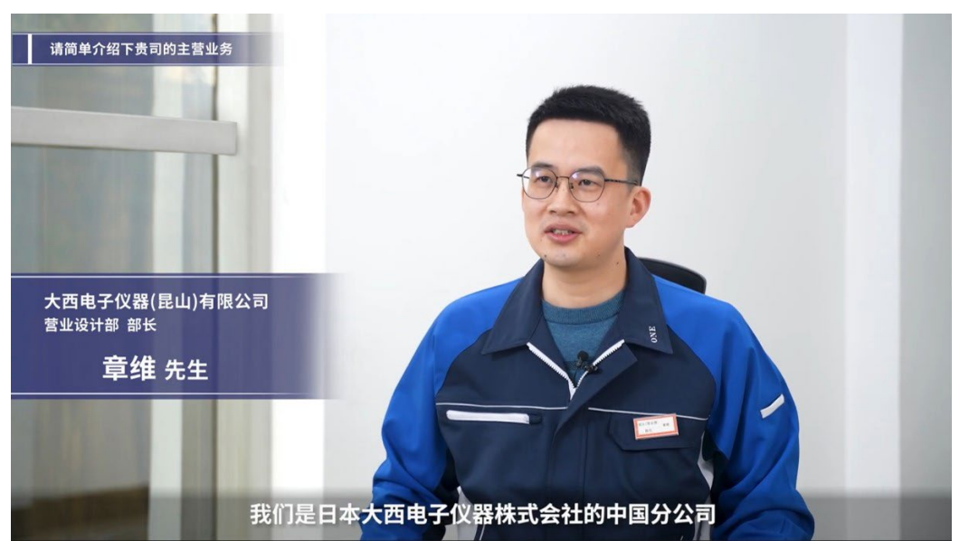
[meviy China Customer Testimonials] Ohnishi Electronics (Kunshan) Co., Ltd. (Video created by MISUMI: https://youtu.be/le1znqNp0BY)