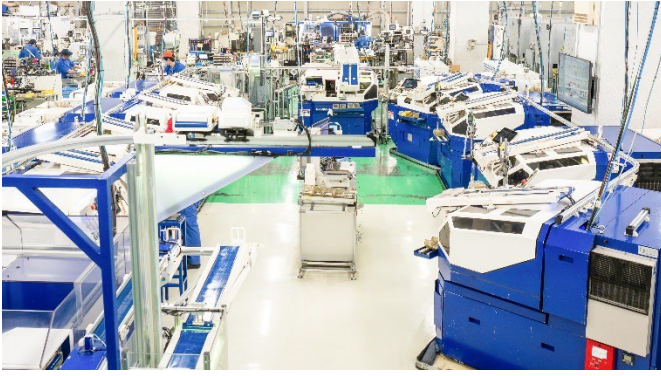
The MISUMI Production System (ALASHI STADIUM)